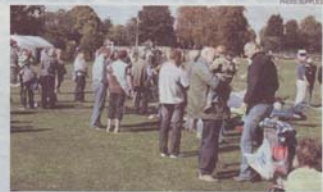
Melton and District Model Club's annual show

re-enactment of the Dambusters display in miniature using pyrotechnics.