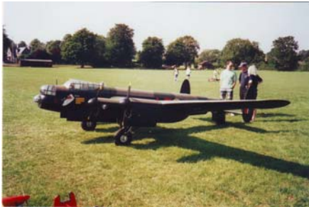
1/4 scale Lancaster

Flying moved to Kirby Bellars for a time, moved to the John Ferneley School playing field., before finally locating to our current sites at Whissendine, Melton Airfield and Burrough Hill.