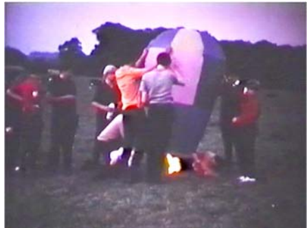
Free flight hot air balloon

The club started flying near Burton Lazars, mainly control line combat and free flight models, and had club meetings in a nissen hut on Kirby Lane which had been part of the Polish resettlement camp. Meeting then moved to Warwick Lodge followed but a temporary hut on our current clubroom site before the permanent building we now use was erected.