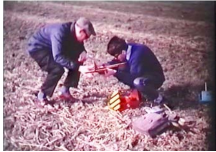
Flying 70's style